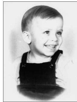
Figure 2. At age 2.

My dad and I had a close relationship. I enjoyed him immensely. I spent a lot of time with him when I was small. Early, I