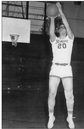
Figure 4. At Sewanee, 1966.