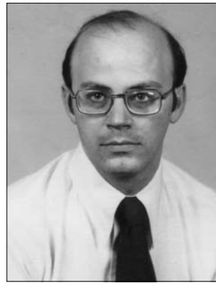
Figure 5. In medical school, 1972.

Armstrong: I knew pretty quickly that I was not going to do surgery. I didn't enjoy it. I didn't have good hand-eye coordination. (If one is not very good at something, one probably does not enjoy it.) I liked taking care of patients, I enjoyed patient interaction a lot, so I knew I would do something clinical. My choices were internal medicine or pediatrics. I actually