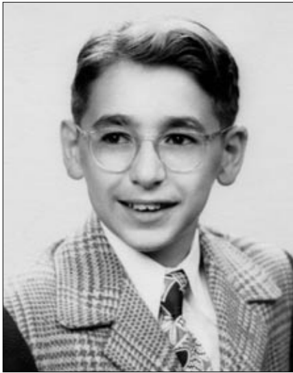
Figure 3. At age 12.

He was stationed in Norman, Oklahoma, where we lived from 1944 to 1946 (Figure 3), when we moved to Dallas.