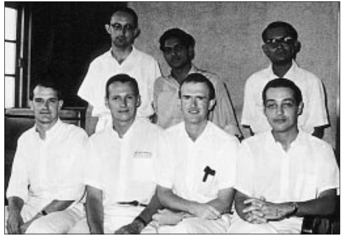
Figure 4. Age 25 years at Infectious Disease Hospital in Calcutta, 1963.

PED: The hospital was primitive. The intravenous equipment included needles which sat in some red juice (merthiolate) in a kidney basin at the end of the ward and rubber tubing hooked up to open flasks. Each patient was given only 1 liter of fluid made on the unit. Talk about pyrogenic, patients often spiked to 105° or 106°. It showed me how tough the human constitution could be. The patients lay on “cholera beds,” which had holes in the middle, so that their feces fell into pails that could be emptied. There was no use of bicarbonate and no attempt to keep up with the fluid loss. An Indian physician was there in the mornings for rounds. Both he and the nurses left in the afternoon. The pa-