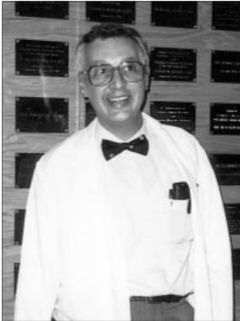
Figure 7. With Osler bow tie at farewell party from The Johns Hopkins Hospital, 1991.