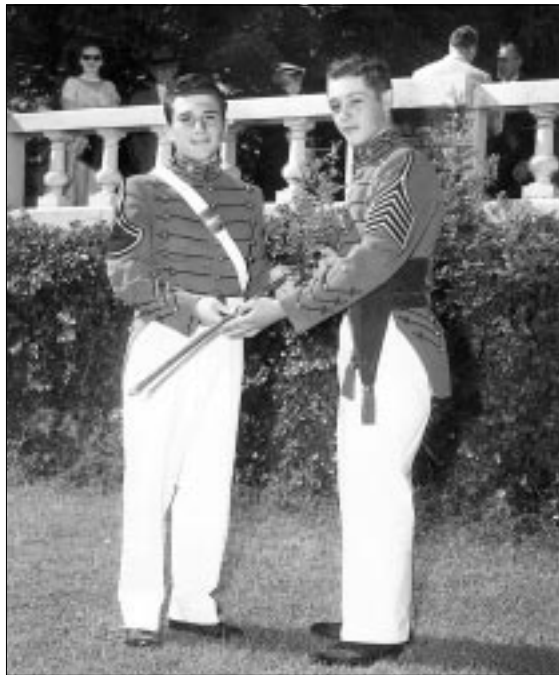
Figure 2. As a cadet lieutenant colonel at LaSalle Military Academy, 1953.