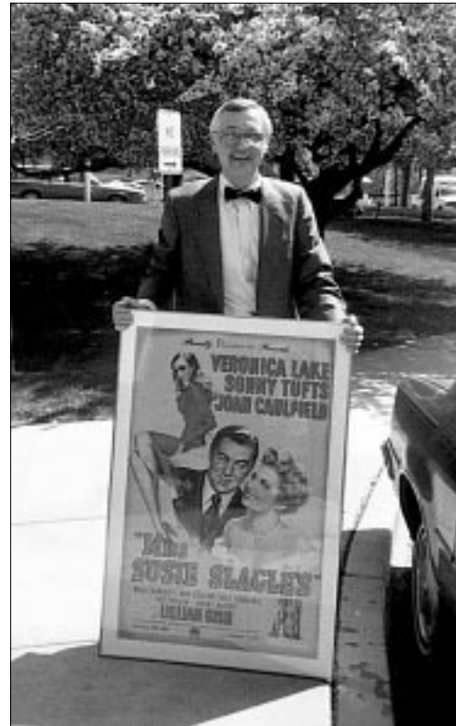
Figure 8. With Miss Susie Slagle's poster, 1986.