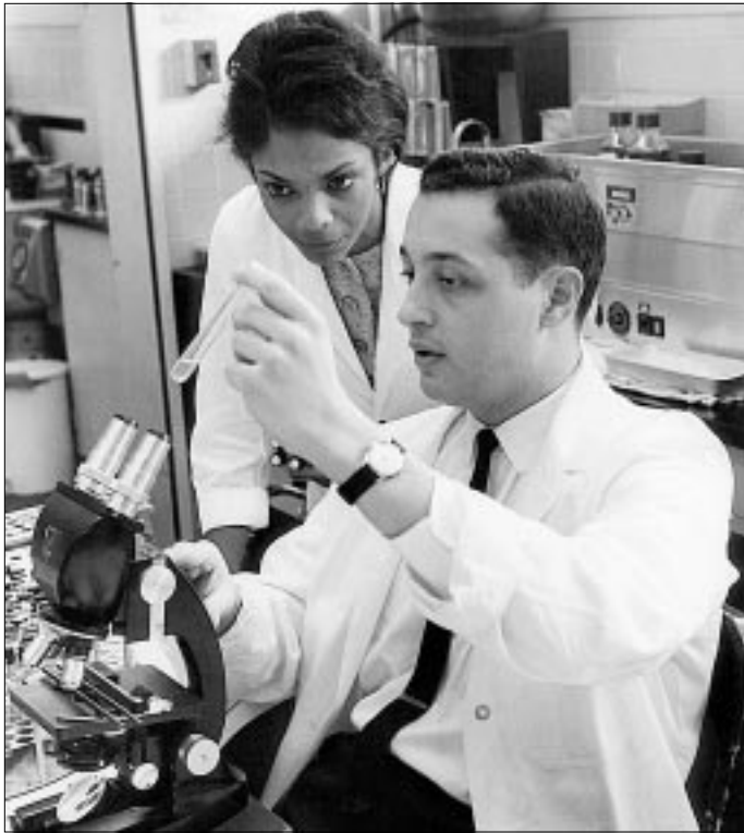
Figure 5. In the NIH Laboratory of Viral Diseases, 1966.

wasn't sure what I wanted to do at that point. Hopkins did not have a lot of divisions or a lot of rotations through specialties at the time.