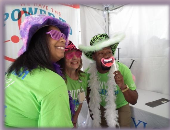
Employees enjoying the Baylor Research Institute Carnival

Nursing Research took the opportunity to join in on the fun and disseminate information regarding Nursing research activities. Nursing Research sponsored a booth at Baylor University Medical Center and enjoyed walking the halls of various facilities to celebrate research and provide giveaways.